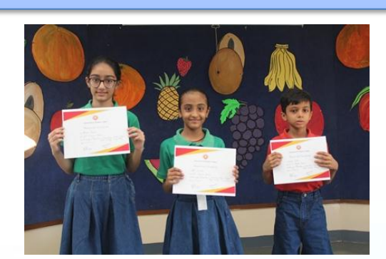
Inter-house Greeting Card competition was held on 22<sup>nd</sup> July, 2019 for the students of classes I and II. The results are as follows: